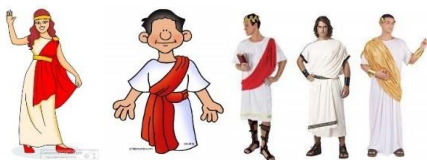
Examples of Roman Tunics for Ancient Roman school children