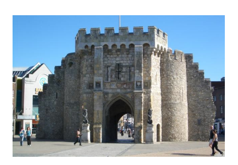
Year 3 Summer 1 Our Curriculum

This term our learning is themed around Southampton.