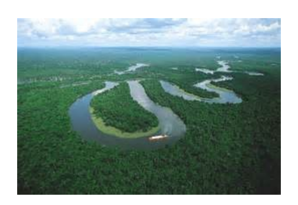
Year 4 Summer 1 Our Curriculum

This term our learning is themed around Rivers.