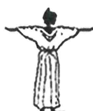
How to make your own from a sheet