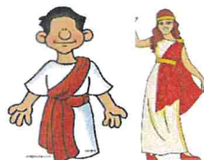
Examples of Roman Tunics for Ancient Roman school children