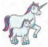
born with a horn