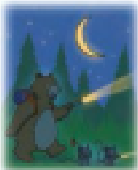
march in the dark