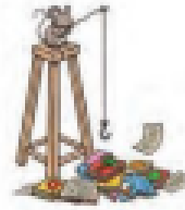
hook a book