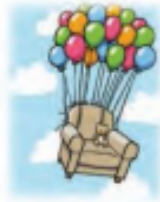
chair in the air

Phonemes we will be focusing on this week in school -