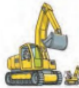
a bigger digger