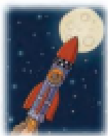
zoom to the moon.

Phonemes we will be focusing on this week in school -