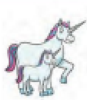
born with a horn