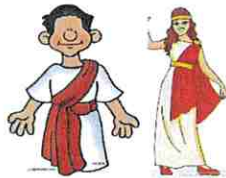
Examples of Roman Tunics for Ancient Roman school children