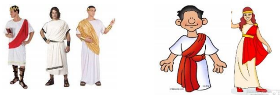
Examples of Roman Tunics for Ancient Roman school children